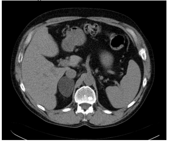
Figure 1: A transaxial CT image without contrast enhancement shows a 5 cm homogenous circumscribed well delineated tumor in the right adrenal. The attenuation in the tumor was measured by placing a circular region of interest (ROI) in three contiguous slices and resulted in a mean attenuation of minus 15 Hounsfield Units consistent with a benign adrenocortical adenoma.

Incidentalomas which at CT appear morphologically benign and measure ≤10HU in the pre-contrast CT examination can be diagnosed as a benign adrenocortical adenoma with 98-99% specificity (1-2). According to Swedish National guidelines benign adrenocortical adenomas measuring less than 3-4 cm in transaxial diameter generally require no further imaging or radiological follow-up but the routines in this respect varies in different countries. In order not to misdiagnose a simple cyst (attenuation approximately 0-15 HU) as a benign adrenocortical adenoma, it should, however, be confirmed that the lesion is contrast-enhancing. Similarly, there is generally no need for further imaging in larger lesions >4 cm that are apparently benign, for example a myelolipoma or a cyst. An example of a benign adrenocortical tumor characterized by attenuation measurements at CT is shown in Figure 1.